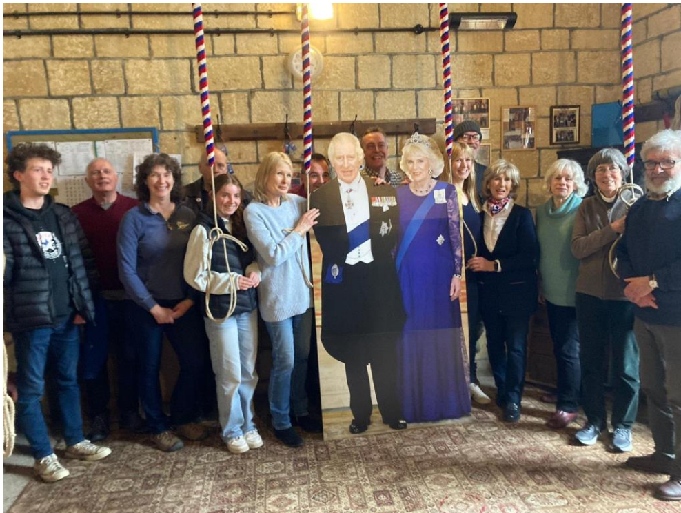
Blockley Coronation Ringers – May 2023